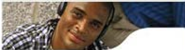
OBTAIN AN AA/AS-T @ CCC