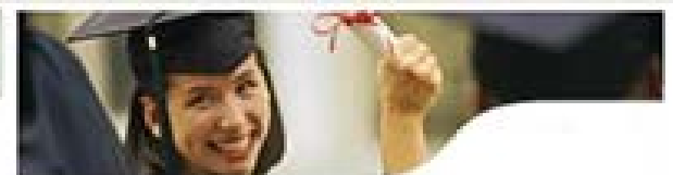
TIME TO DEGREE = 2 YEARS