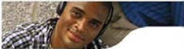
OBTAIN AN AA/AS-T @ CCC