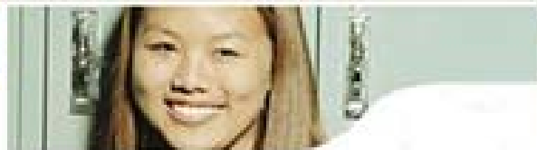
APPLY CSU SIMILAR MAJOR