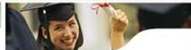
TIME TO DEGREE = 2 YEARS